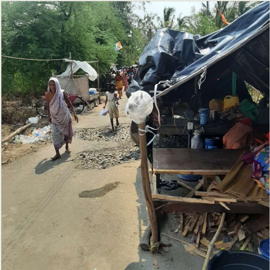
People displaced from their marooned village homes are forced to dwell in make shift tarpaulin strappings on the embankments.