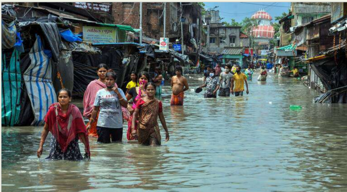
In Kolkata, people waded through flooded roads in the after math of 'YAAS' and perigeon high tide.